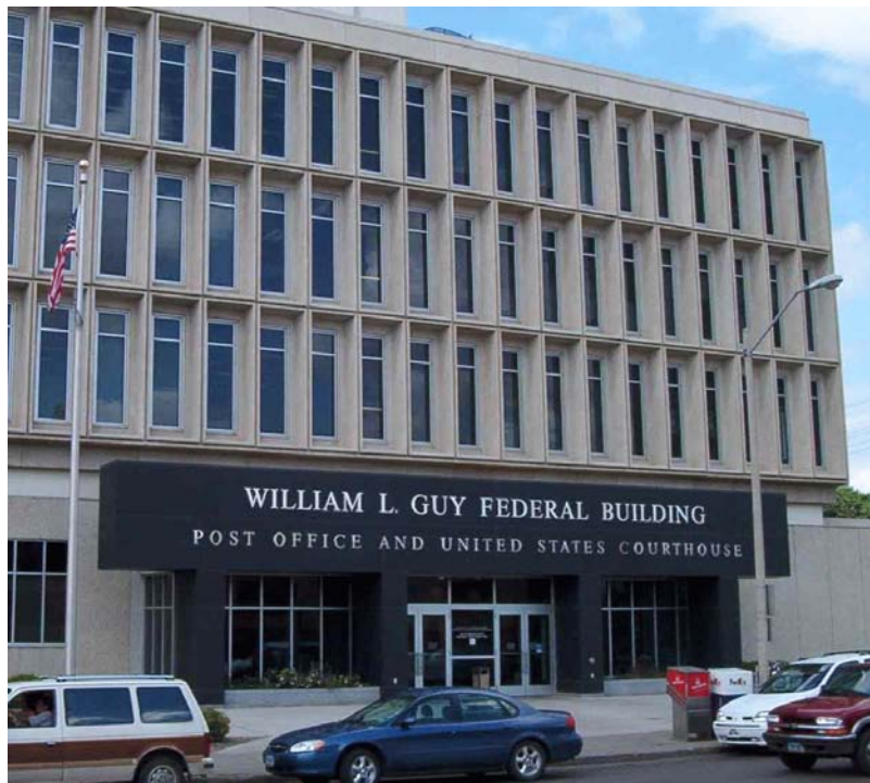
William L. Guy Federal Building 220 East Rosser Avenue, Bismarck, North Dakota