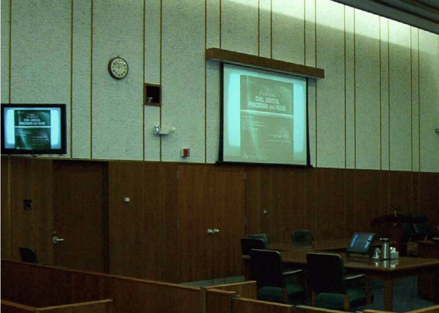
Courtroom Number One in Bismarck