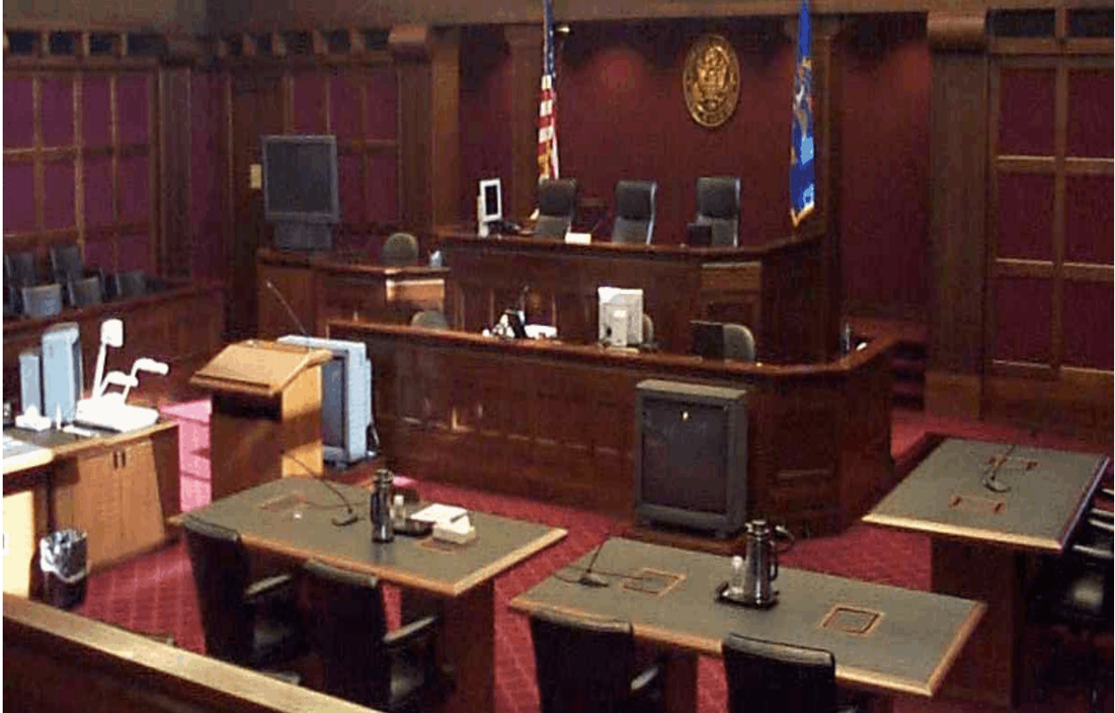
Courtroom Number One in Fargo