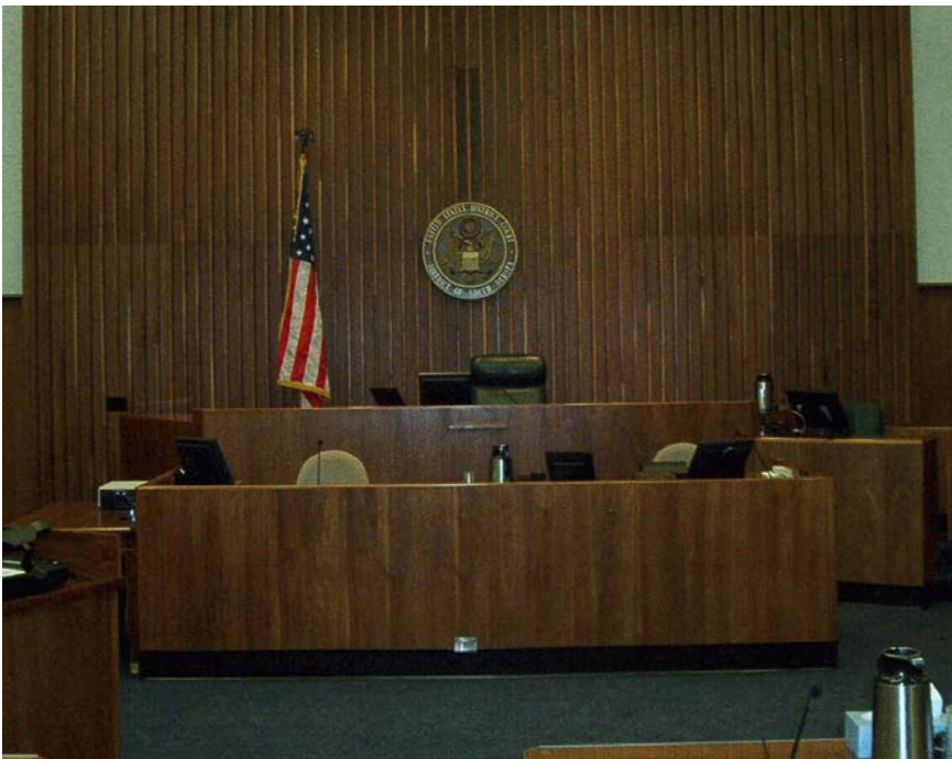
Bismarck, North Dakota