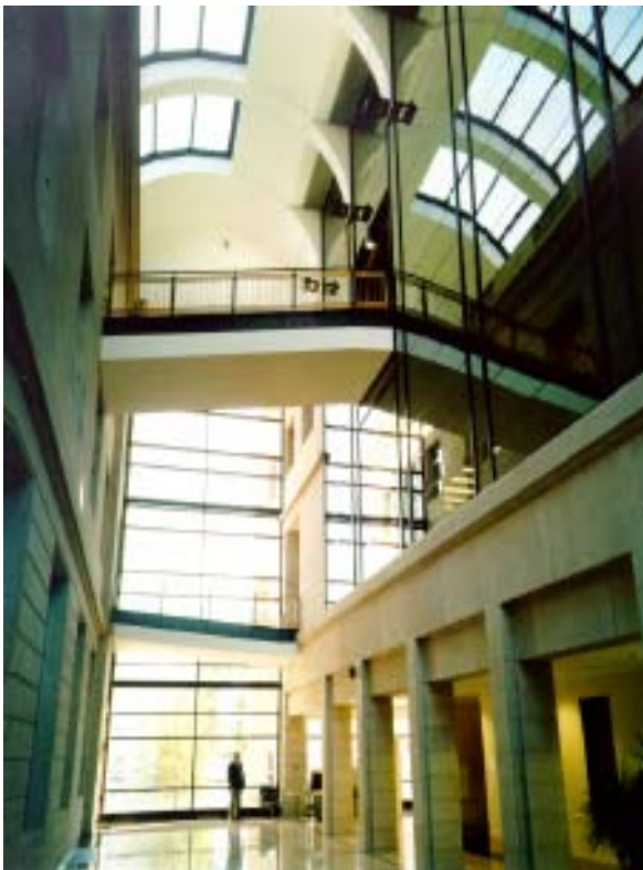
Atrium in the Quentin N. Burdick Federal Building.

This guide is an operational manual for the courtroom equipment explaining how to run each of the technical components of the system. The Clerk's Office staff will be happy to assist and answer questions regarding court technology.