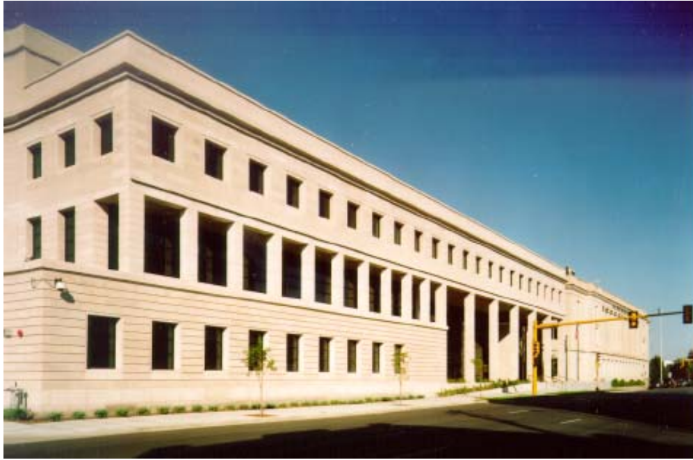
Quentin N. Burdick U.S. Courthouse 655 1 st Avenue North, Fargo, North Dakota